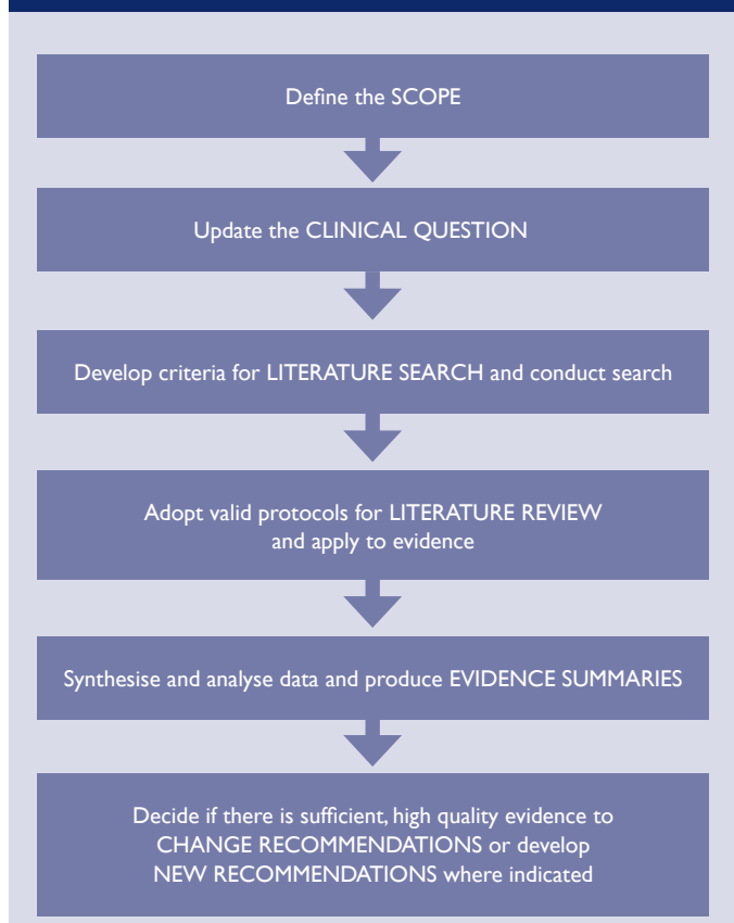
Figure 2: Summary of the six basic steps identified in the updating of a Guideline (33)

it would be reviewed and updated as required. In 2009 the BACPAR Executive Committee decided to review and update the guidelines. This was perceived as necessary due to potential changes in physiotherapy management over time and the possible new evidence available. Priority was given to this update to ensure the work remained relevant and valid.